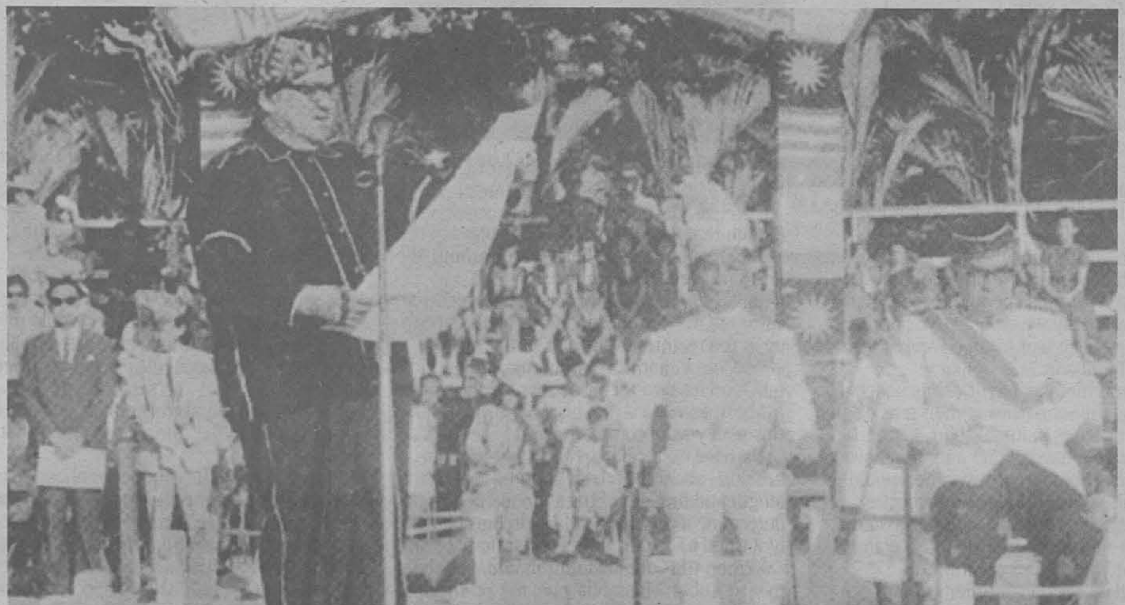
Historic moment: Datu Mustapha is seated with then Deputy Prime Minister Tun Abdul Razak as Stephens reads the Proclamation of Independence of Sabah at the Jesselton town padang on Sept 16, 1963.

pendent, that we would determine our future."