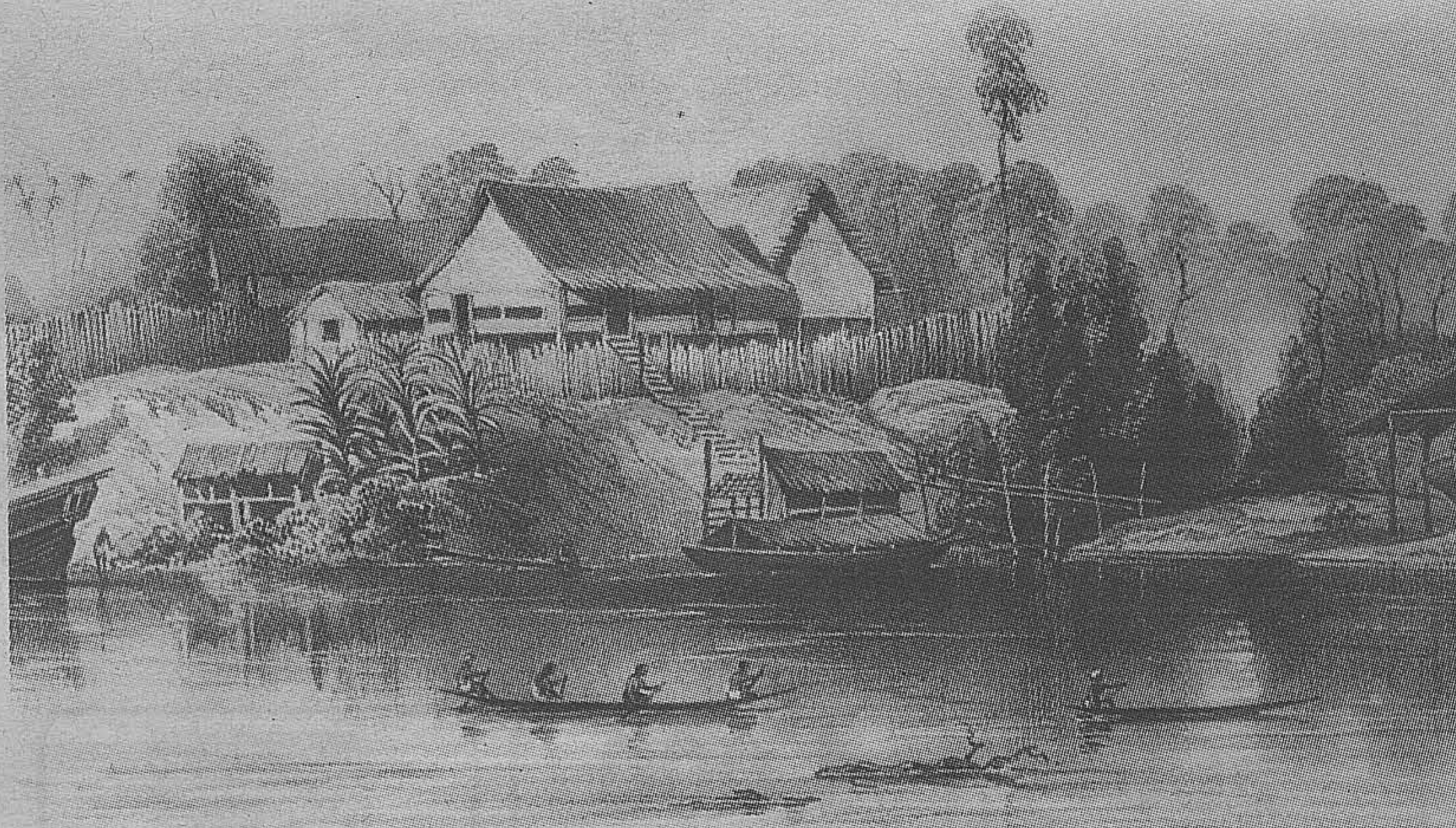
James Brooke's house in Kuching.

Though not much is heard about him or mentioned in history books, the first man who really fought to be free from British rule and to