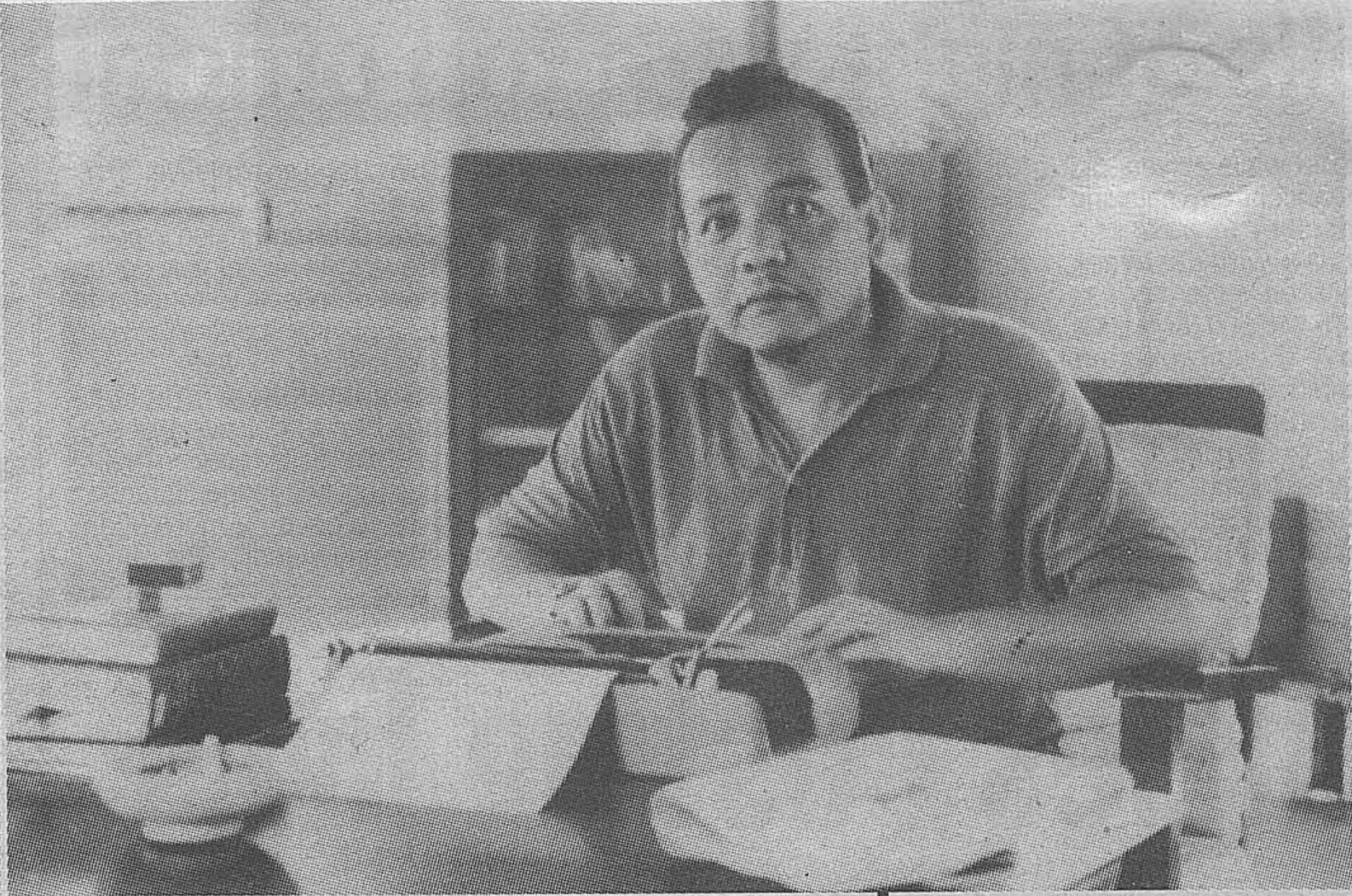
Datuk Ahmad Boestaman.