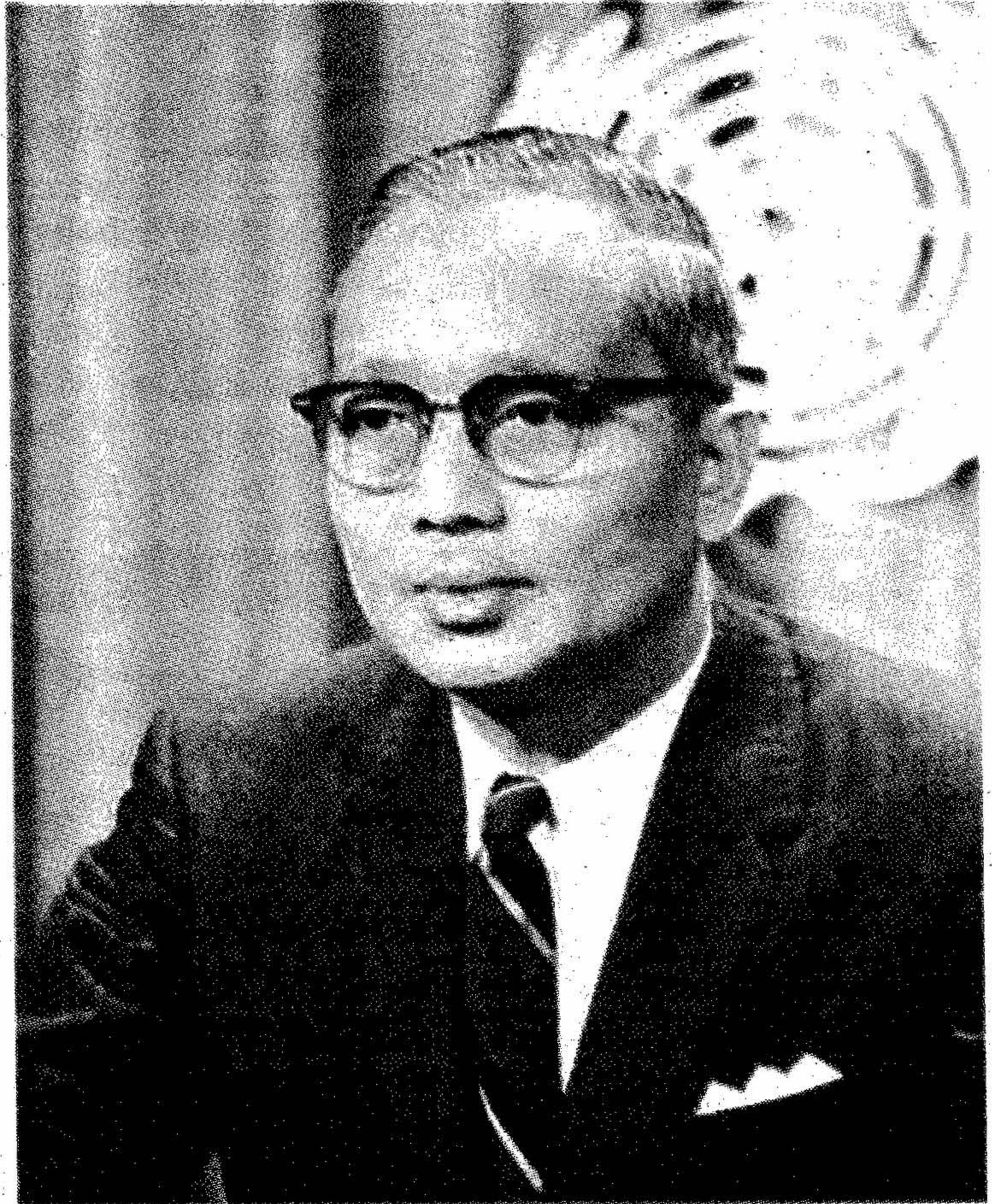
The man behind the road: U-Thant worked in various departments of the Burmese government before taking on the post of secretary-general of the UN.

He then took on the post of secretary at the Ministry of Information and in 1953, he was made the secretary at the Prime Minister's Office and two years later, he was assigned additional duties as executive secretary to Burma's Economic and Social Board.