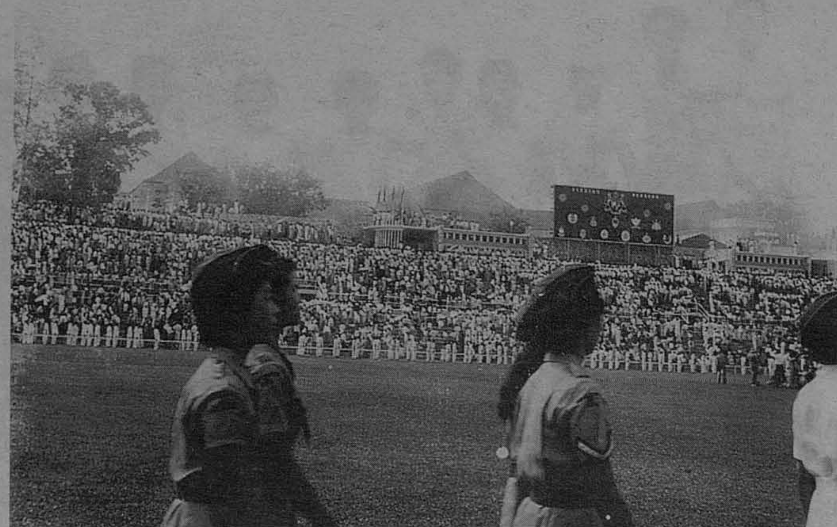
A view of the field and the crowd at Stadium Merdeka on Aug 31, 1957.