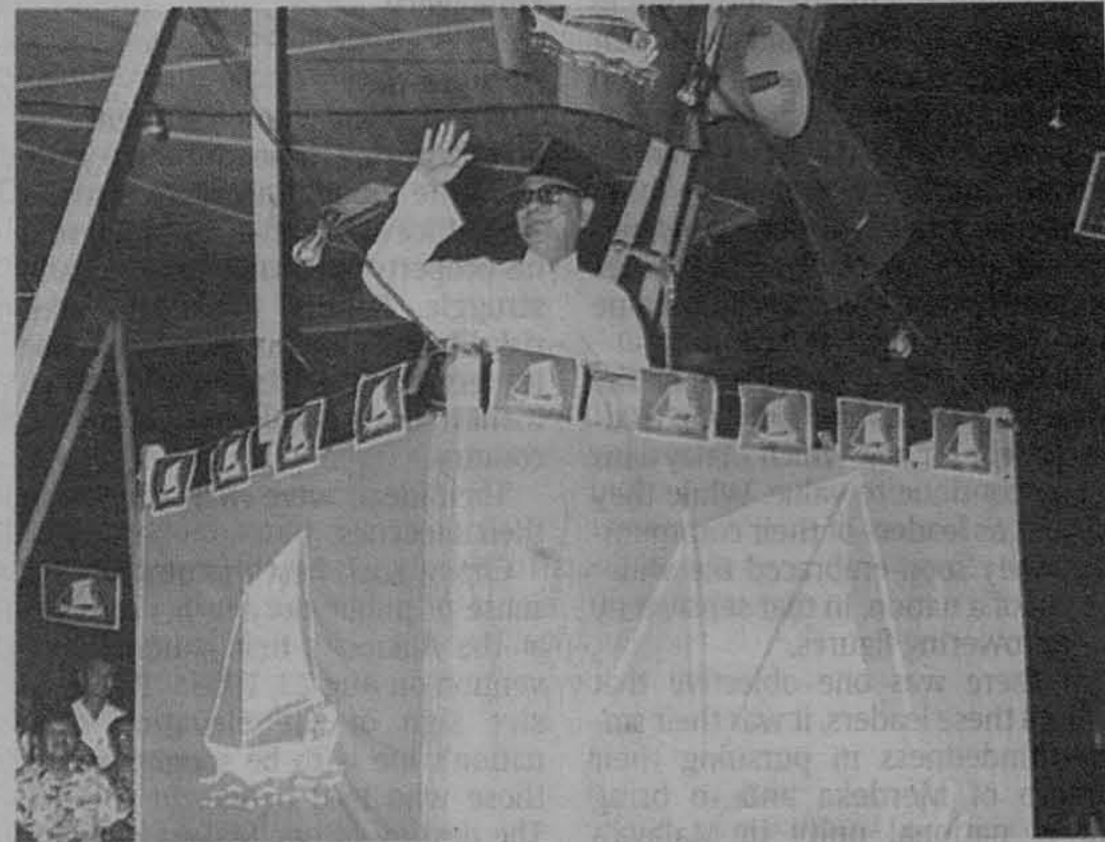
Mass support: Tunku campaigning in the first parliamentary elections in 1959 under the Alliance Party.

For a while they thought of setting up a separate regional arrangement but in the end they were persuaded by Tunku to be