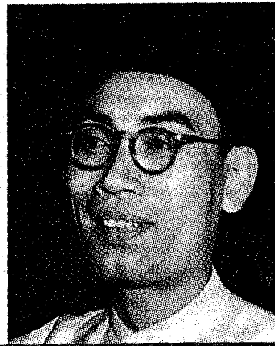
■ Dr Burhanuddin Al-Helmy