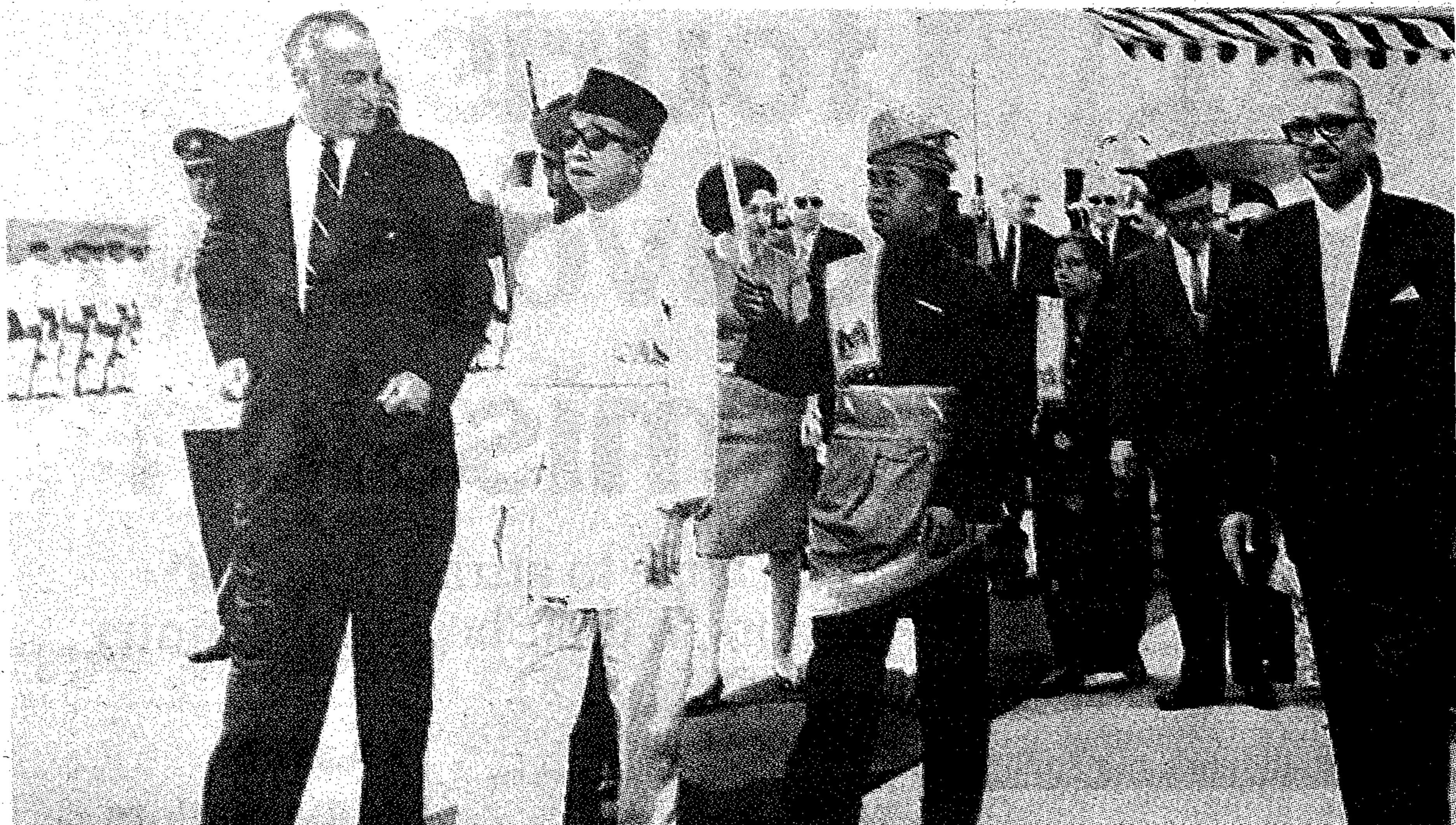
VVIP's visit: President Lyndon B. Johnson walking side by side with the Yang Di Pertuan Agong in 1966. Accompanying them (on the right) is the country's first Prime Minister Tunku Abdul Rahman.

The exhibition in Kuala Lumpur ended yesterday. However, it will be taken to libraries in Terengganu, Kuching, Malacca, Kota Kinabalu and Kelantan.