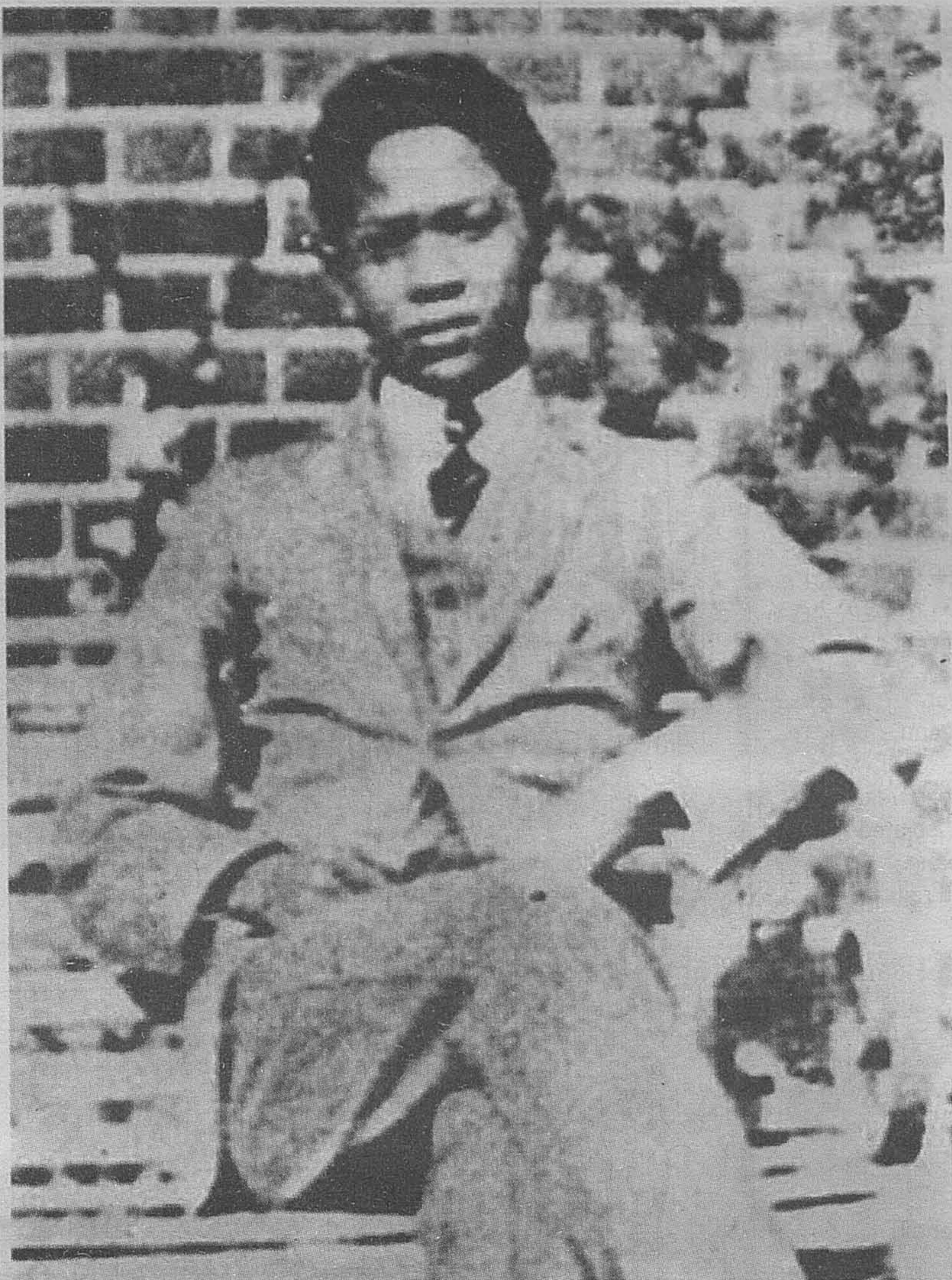
Early days: Tunku Abdul Rahman at Cambridge.

As a first step, the Alliance decided to revamp the wholly nominated Legislative Council and demanded that elections be held for council seats. After considering similar demands from the IMP, the colonial government agreed to a small majority of elected seats, fixed at 52 out of