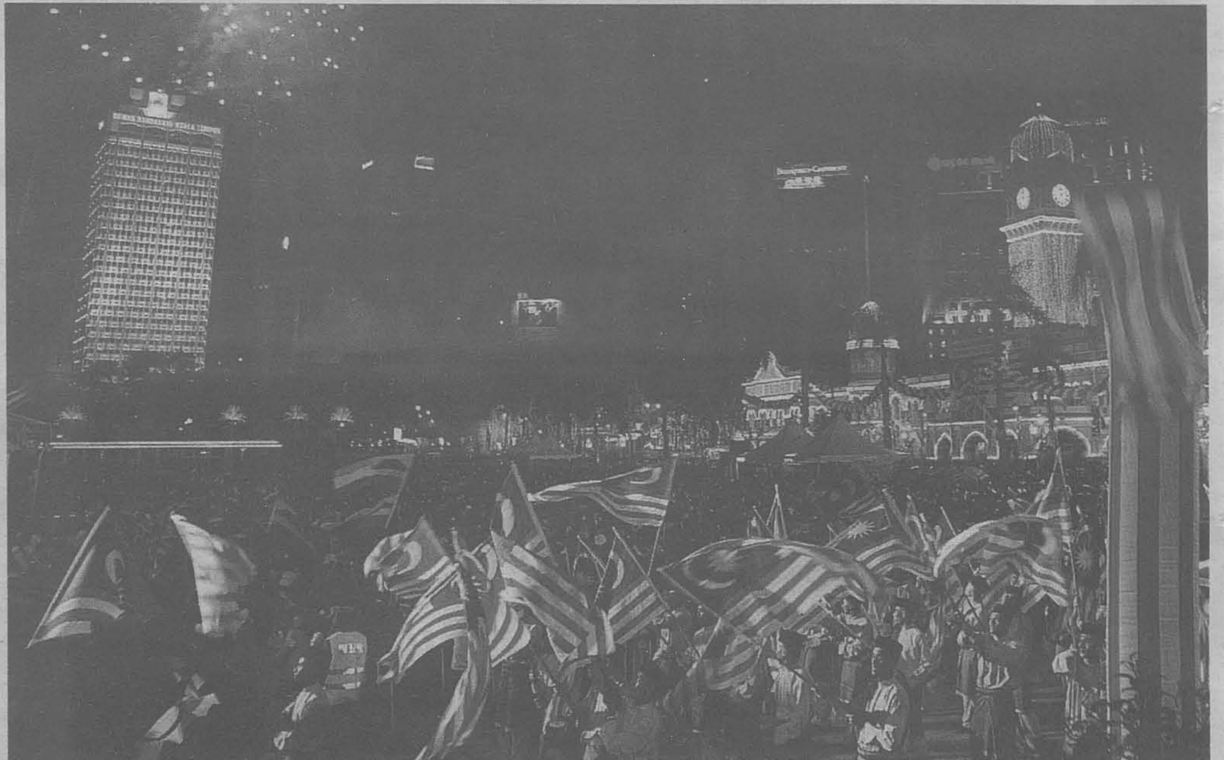
Glowing tribute: We can all see how much the Alliance and the Barisan Nasional have done for the people, so much so that Malaysia has been mentioned as the shining light of South-East Asia.

Education was in a very shocking state. There were only a few schools for boys and the standard of education was so poor that those leaving school at the age of 12 to 13 years had no career to look forward to except, if lucky enough, to be taken on as office peons, policemen and labourers. The