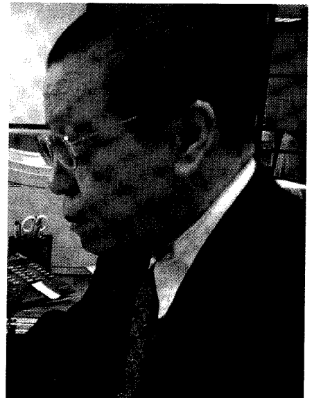
Lim: Local council chiefs are often only obligated to those who appointed them

problems, he feels abolishing these councils would not be the answer.