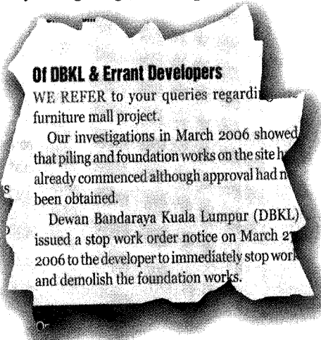
Kuala Lumpur City Hall's response to a Malaysian Business article on an illegal furniture mall