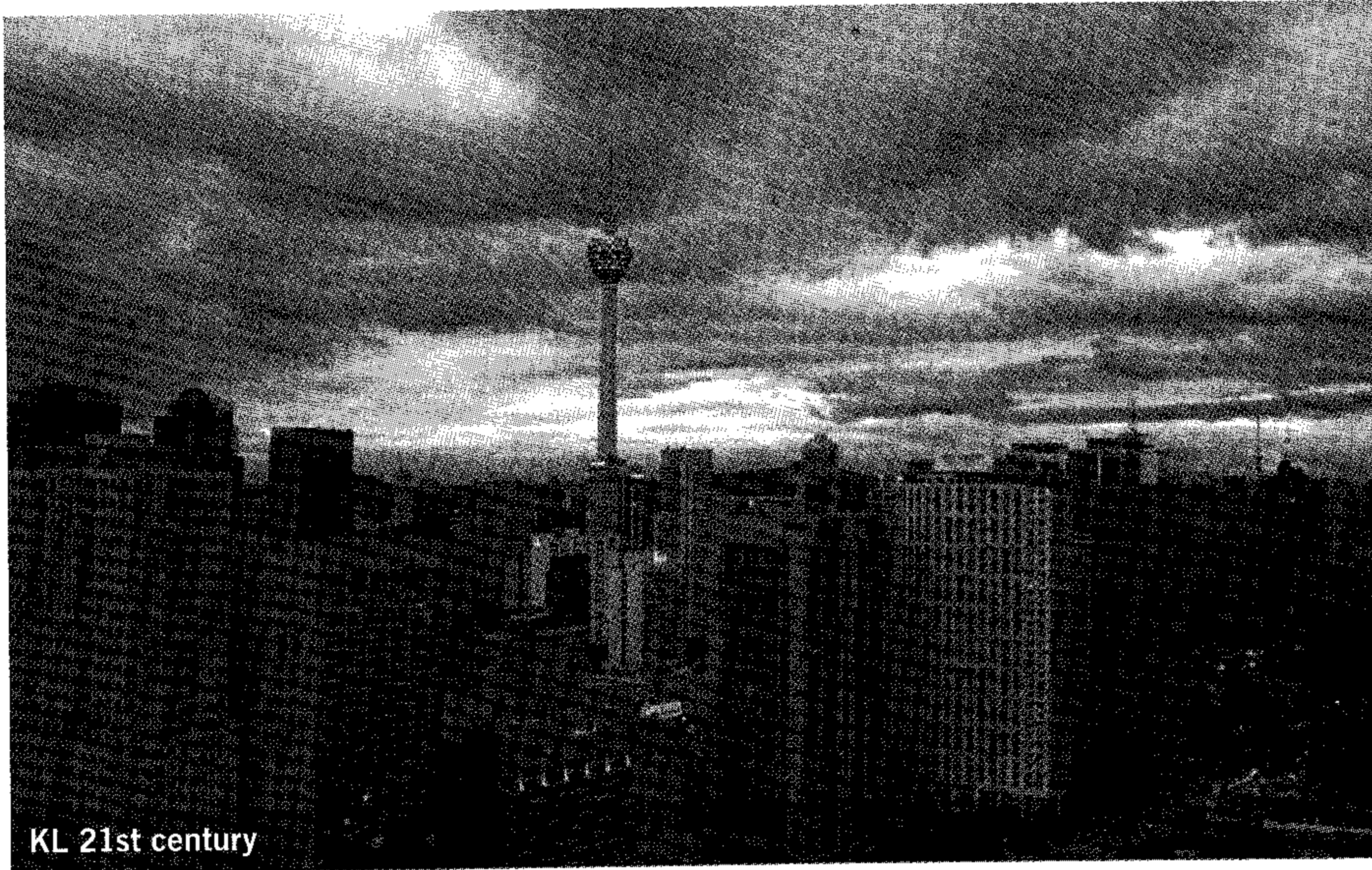
KL 21st century