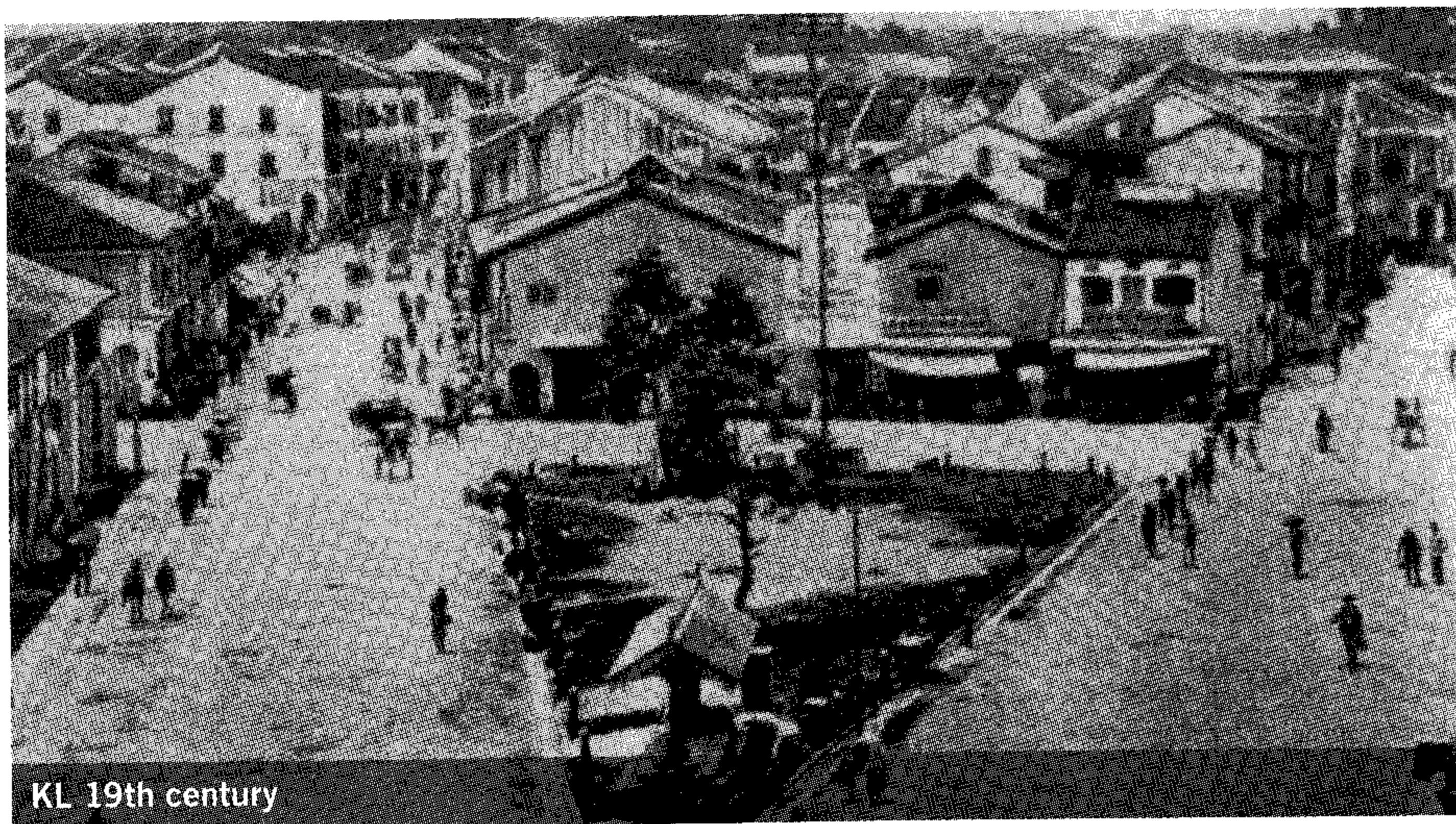
KL 19th century

Capital of the country and largest city of Malaysia, Kuala Lumpur is the urban powerhouse that declares to the world that KL is a global city, an Asian metropolis. With 150 years of existence under its belt it has much to be proud of (see box). But one of the things its distinctly proud of—even though it resides in the state of Selangor—is being one of the three Malaysian Federal Territories (the others being Putrajaya and Labuan) a status given to it in 1974. The country's legislature sits in the city, hosting both