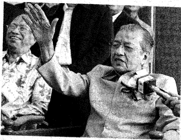
Tun Dr Mahathir Mohamad responding to questions during a press conference yesterday.