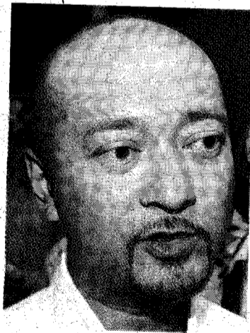
Datuk Mukhriz Mahathir

"I am not sure if the BN will win with a big or small majority. But win, that's for sure."