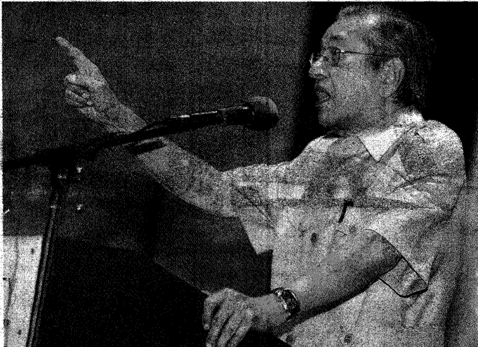
Tun Dr Mahathir Mohamad at the Kedah Malay Assembly Hall meeting in Alor Star yesterday.

rious tone, said: "Waa, saya di cabar ni... (I have been dared). Yes, I will leave Umno... until the party leadership is determined. Other Umno members should follow me."