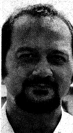
Gobind Singh Deo says Tun Dr Mahathir wants his way even after retirement