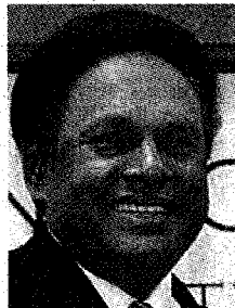
Samy Vellu: Lost in the elections