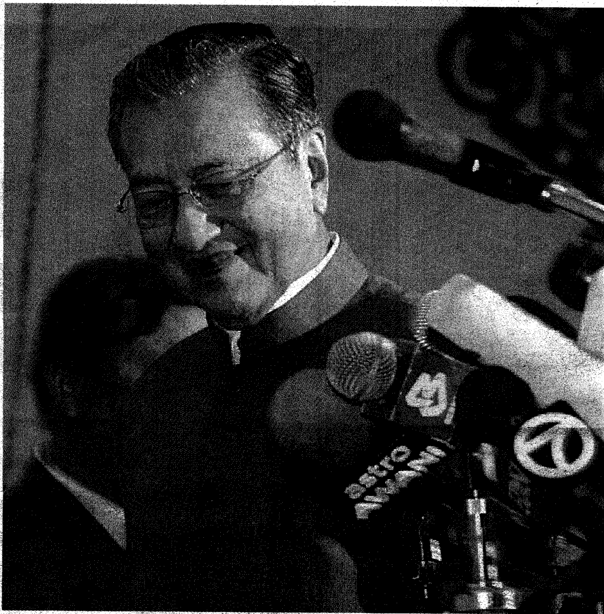
Media magnet: Always the newsmaker, Tun Dr Mahathir Mohamad has been pushing the dial a little further each time he spoke.