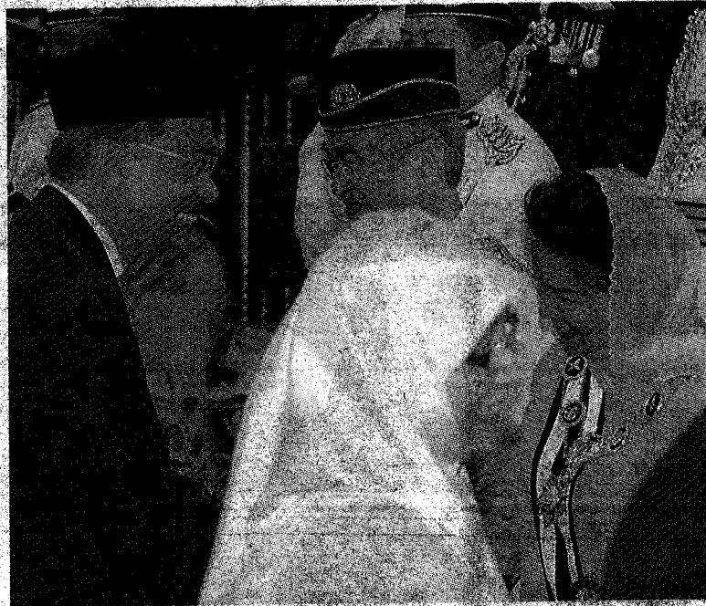
Friendly gesture: Abdullah and his wife Datin Seri Jeanne Abdullah being greeted by Anwar and Dr Wan Azizah at Parliament yesterday.

"No, I just said 'hello' to the Prime Minister Datuk Seri Abdullah Ahmad Badawi, as I was seated at the table where the other spouses were sitting with the Queen. The