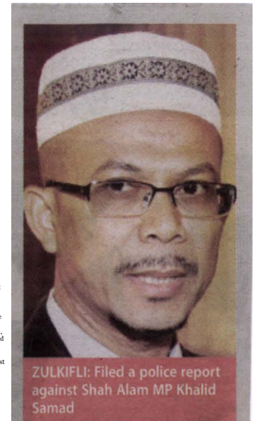
ZULKIFLI: Filed a police report against Shah Alam MP Khalid Samad

Zulkifli argued that the use of the word 'allah' by non-Muslims in the Malay edition of the Catholic publication Herald was "an issue that threatened the social fabric of Malaysia and was not a political matter".