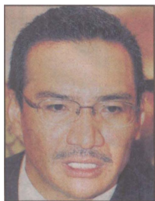
Hishammuddin reiterating the seriousness of the government in reducing crime at the recent GTP Roadmap launch.

and bringing about the results we have set out to achieve. But more importantly, we want the people to know that the government is serious about transforming the country into a better place for everyone. We will continuously monitor our activities to ensure that we do not let up on the momentum we have garnered thus far."