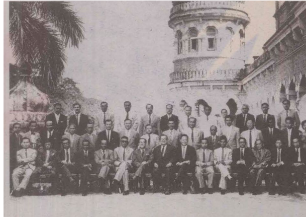
The Malaysian Solidarity Consultative Committee produced a memorandum that protected the right of indigenous people and Malays.

It concluded that the formation of Malaysia should be carried out with one-third of the population from each state in favour of the federation. But Cobbold said all parties must enter the federation as equal partners.