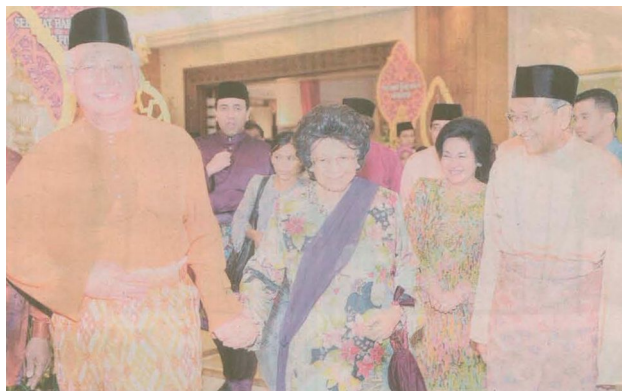
Very special guests: Tun Dr Mahathir has used special occasions like Hari Raya to send a political signal about his feelings on issues and personalities. His presence at the Prime Minister's official residence was a big deal for Najib who is seen here giving Dr Siti Hasmah a hand as their spouses look on with some amusement.

The Internet chatter going on is about a split in Umno but the party's top two leaders remain a committed partnership that enjoys the explicit backing of Tun Dr Mahathir Mohamad.