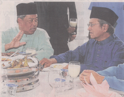
Deputy Prime Minister Tan Sri Muhyiddin Yassin having a discussion with former prime minister Tun Dr Mahathir Mohamad at the latter's open house yesterday.

"The 1Malaysia concept can be seen clearly and I have witnessed it myself as I have attended the open house organised by my Indian and Chinese friends as well."