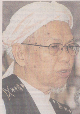
Datuk Nik Abdul Aziz Nik Mat says hudud is for Muslims and not non-Muslims

Nik Aziz was responding to a statement by DAP chairman Karpal Singh who had asked him and Pas president Datuk Seri Abdul Hadi