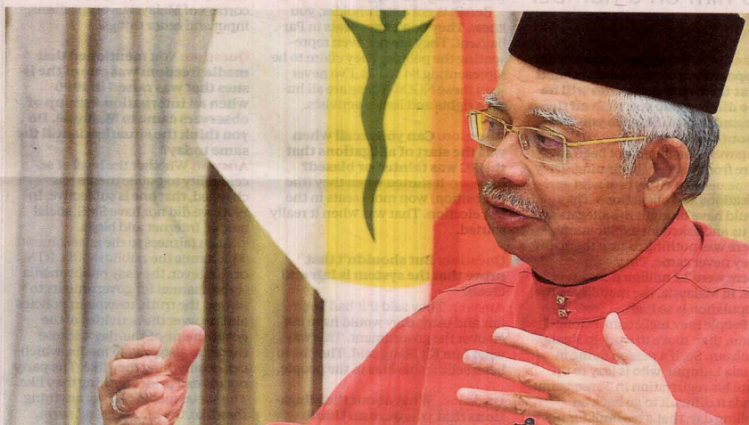
Datuk Seri Najib Razak says the opposition will resort to lies to attack the achievements of the government.

Question: But Datuk Seri, although the people might have been confused by the opposition, due to the lies being told to them, there seems to be no firm and bold action being taken to ensure this will not recur. It seems that this has been going on and on.