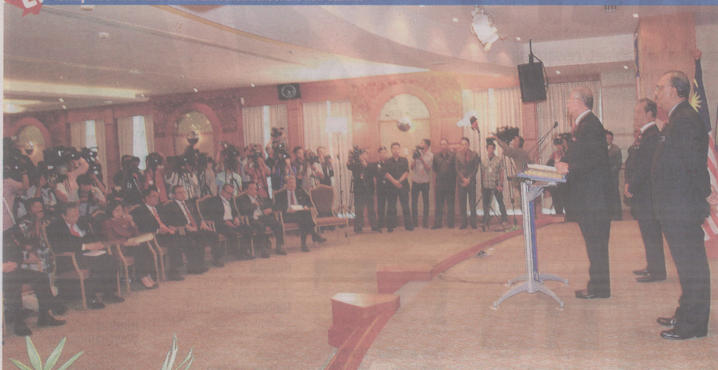
Major reshuffle: Najib with his deputy Muhyiddin by his side (second right) announcing the appointment of the new Cabinet ministers in Putrajaya.