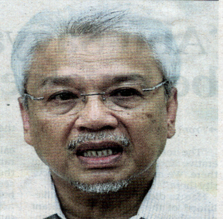
Datuk Seri Ahmad Husni Hanadzlah says Malaysia has to move towards a transparent, efficient and business-friendly taxation system to achieve high-income nation status

"With the GST Bill 2014, Malaysia will be able to reduce dependence on income tax and petroleum revenues, which fluctuate