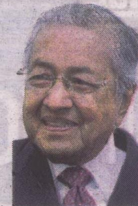
Tun Dr Mahathir Mohamad