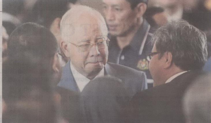
Prime Minister Datuk Seri Najib Razak comforting victims' next of kin at the MH17 memorial ceremony at the Bunga Raya Complex in Sepang yesterday. He urged them to stay strong.

police and prosecutors, to collect evidence that will assist in identifying the cause of the incident. The team comprises members from Australia, Belgium, Malaysia, Ukraine and the Netherlands, which is the coordinator. It will ascertain the perpetrators behind the downing of Flight MH17," he