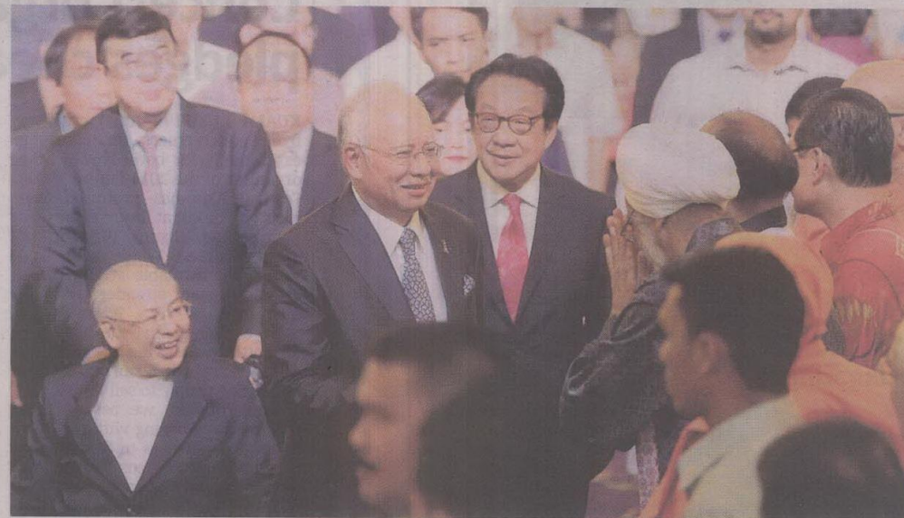
United front: Najib greeting guests at the CPHM launch. Looking on is YTL Corp Bhd managing director Tan Sri Francis Yeoh (Najib's left).

as oxygen, he said people had taken it for granted but they would die without it.