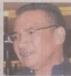
Hishammuddin: Feeling the pressure.