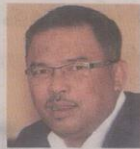
Idris: Every prime minister had their troubles.