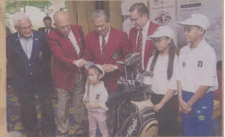
Tan Sri Muhyiddin Yassin after officiating the DRB-Hicom Tan Sri Muhyiddin Golf Challenge in Shah Alam yesterday.

namese boat people" saga, referring to refugees who had fled Vietnam by boat and ship after the Vietnam War in 1978 and 1979.