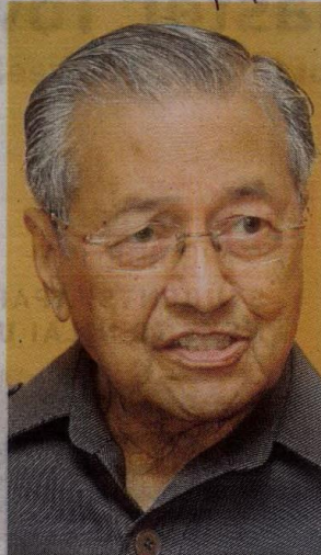
Tun Dr Mahathir Mohamad appears to have emerged as the new opposition leader

"So who do the opposition members of parliament work for, the rakyat or Dr Mahathir?" he said, adding that even Pas and indepen-