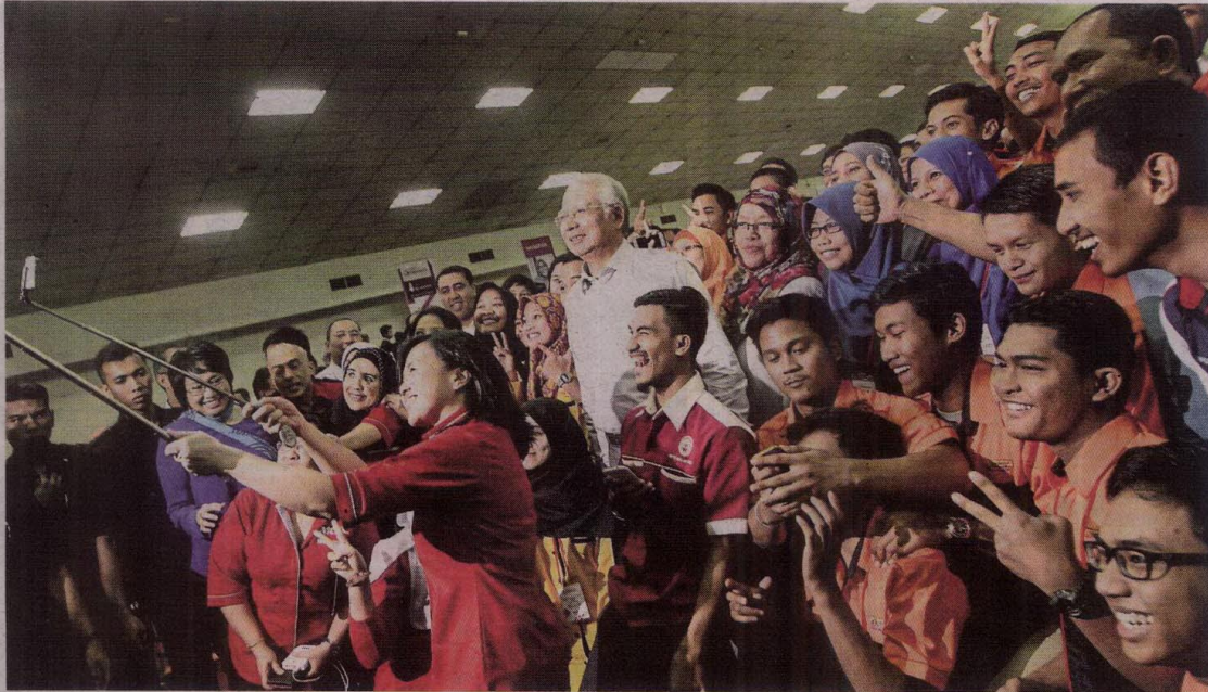
Smile for the camera: Najib posing for 'selfies' with eUsahawan programme participants after the launch at PWTC.