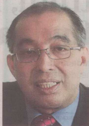
Datuk Seri Salleh Said Keruak says Tun Dr Mahathir Mohamad should apologise to the prime minister

KUALA LUMPUR: The auditor general's interim audit report on Malaysia Development Bhd (1MDB) has proven that Tun Dr Mahathir Mohamad's allegations against the sovereign wealth fund are incorrect.