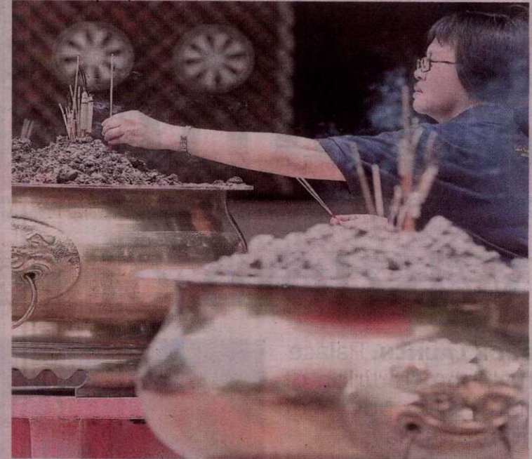
A woman burning incense at the Buddhist Maha Vihara temple in Brickfields, Kuala Lumpur, yesterday, in preparation for Wesak Day today.