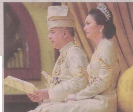
Sultan of Perak Sultan Nazrin Muizzuddin Shah and Raja Permaisuri Perak Tuanku Zara Salim. Sultan Nazrin's enthronement is a showcase of the rich traditions behind the Malay rulers' legacy in the peninsula, which date back to the Malacca sultanate.

Besides the historical legitimacy earned through conflicts and co-operation throughout the region, culture also played its part in the homogenisation process of the ethnic Malays. Despite leaving their birthplaces and travelling abroad across the straits to begin a new life and existence in a strange land, they were made to feel at home very quickly. What mattered was