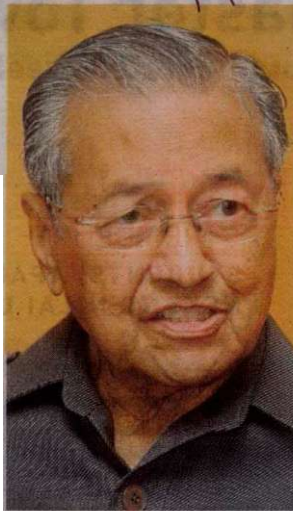
Tun Dr Mahathir Mohamad appears to have emerged as the new opposition leader