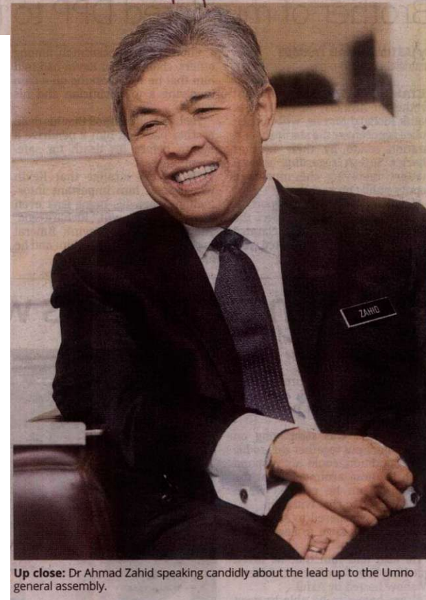
Up close: Dr Ahmad Zahid speaking candidly about the lead up to the Umno general assembly.

The main assembly will be from Dec 10 to 12 where Najib will deliver his presidential address on the first day.