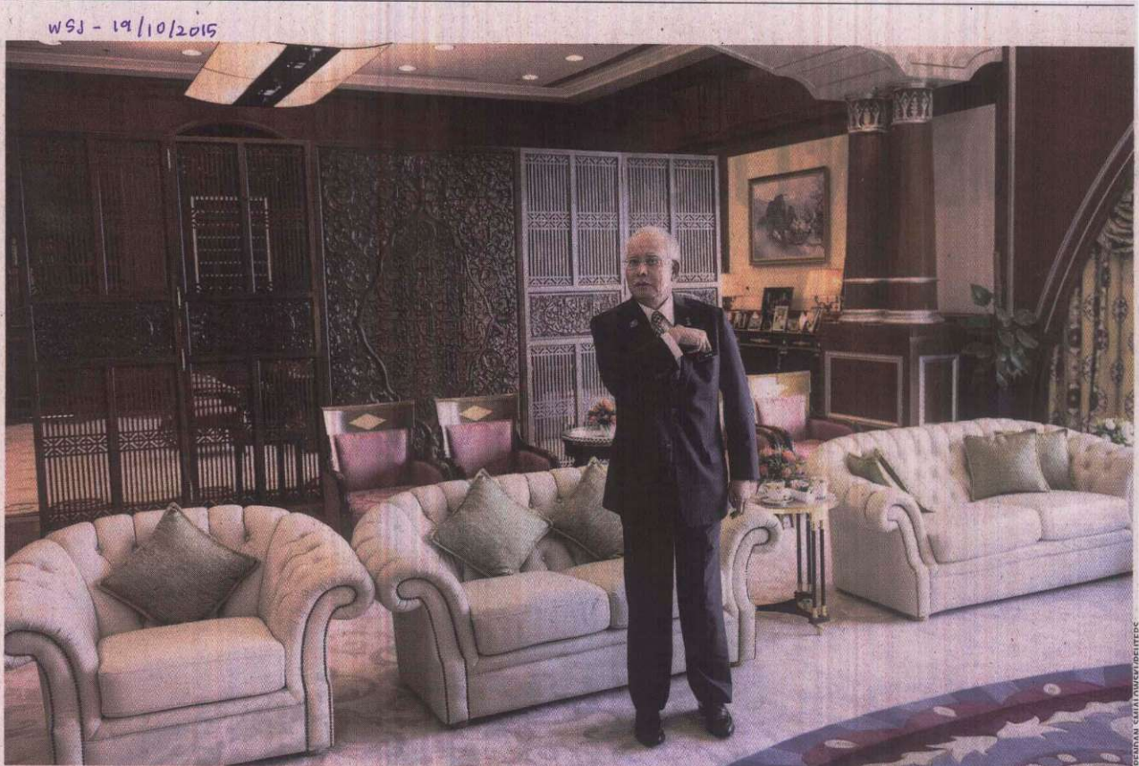
Malaysian Prime Minister Najib Razak, shown in August, set up IMDB, a fund that has become the center of a political scandal engulfing Malaysia's government.

He played a leading role in raising billions of dollars in financing for the fund, people familiar with the matter said, and Mr. Najib's cabinet approved the $3 billion bond deal he enlisted Goldman to arrange in early 2013. That deal included a fee to the bank of nearly $300 million, said people close to the bank, far above the $1 million typical if a bank doesn't