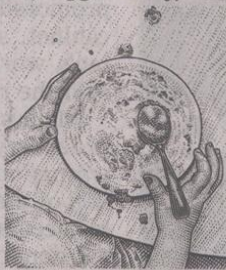
Vegan lentil soup