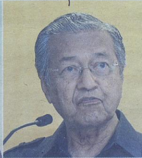
The trend continues and intensifies under Dr Mahathir as he inaugurated a 'Look East Policy'

The trend continues and intensifies under the fourth Prime Minister Tun