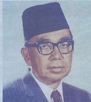
Malaysia under Abdul Razak remained steadfast in non-aligned posture despite heightened Cold War tensions

This signals Malaysia's readiness to embrace greater international political economic spectrum, rather than just being confined into a more rigid and competing free-trade blocs that is currently jostling for supports among the Asean members: The Trans-Pacific Partnership of the US