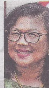
Tan Sri Rafidah Aziz