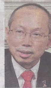
Tan Sri Abdul Wahid Omar