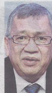
Tan Sri Abdul Gani Patail