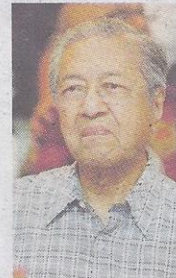
Tun Dr Mahathir Mohamad

He said Dr Mahathir hoped that Najib would lose face in the battle