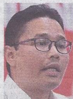
Khairul Azwan Harun

"In fact, Dr Mahathir's actions clearly against the Federal Government," he said, adding that Dr Mahathir should step down as the foundation's honorary chairman.