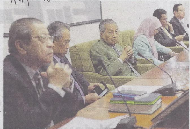
(From left) Lim Kit Siang, Tan Sri Muhyiddin Yassin, Tun Dr Mahathir Mohamad, Datuk Seri Dr Wan Azizah Wan Ismail, Datuk Seri Mohd Shafie Apdal and Lim Guan Eng during a press conference at Parliament yesterday.

OPPOSITION members of parliament have shown how desperate they are by inviting former Prime Minister Tun Dr Mahathir Mohamad to the Parliament House.