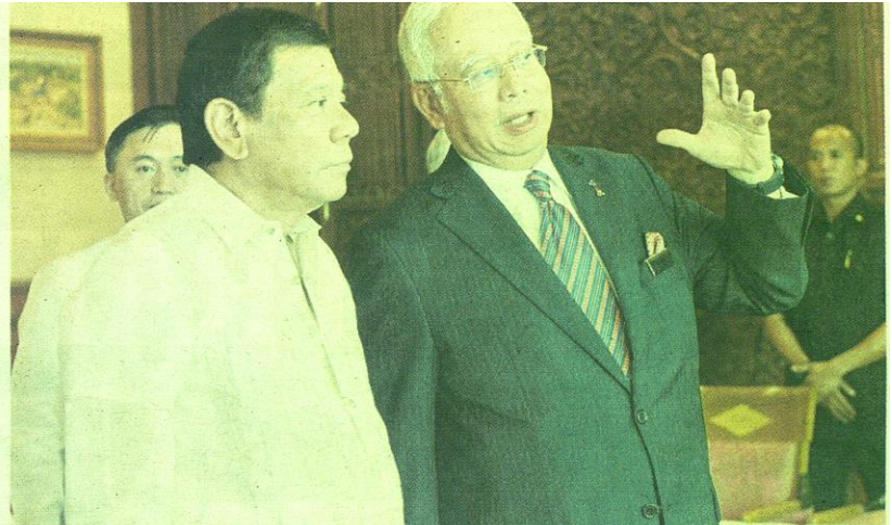
Prime Minister Datuk Seri Najib Razak and Philippine President Rodrigo Duterte at Perdana Putra in Putrajaya yesterday.

Page 1 pic: Prime Minister Datuk Seri Najib Razak greeting Philippine President Rodrigo Duterte outside Perdana Putra in Putrajaya yesterday.