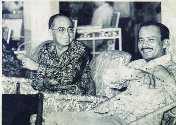
Then prime minister Tun Abdul Razak Hussein (left) sharing a light moment with then inspector-general of police Tun Mohammed Hanif Omar in Kuala Lumpur in 1974. Hanif says in an interview that Razak was noted for being a tightwad, especially with the government's money.

"And then, he would ask why the telegram could cost so much. I had to tell him that they count every word and that if it was a long message, it was going to cost