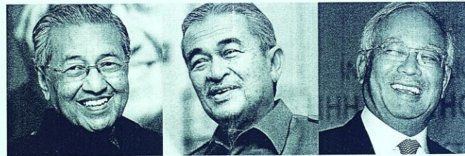
Abdullah has finally joined Mahathir and started blogging. Will Najib listen to his predecessors and discard his preoccupation with the poor election results of 2013?

The lure of the new and easy way of spreading one's views and influencing the world offered by technology seems to have finally proved too much even for him. And letting Mahathir monopolise the stage for retired leaders all these years cannot have been an easy condition to bear either.