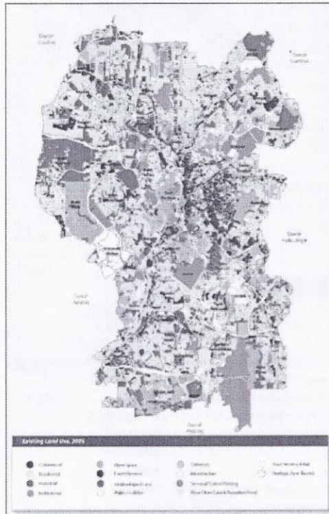
Figure Existing Land Use Map In 2005