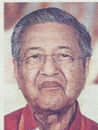
Tun Dr Mahathir Mohamad