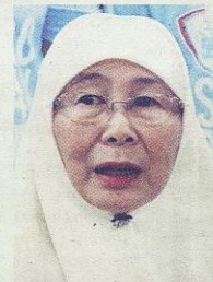
Datuk Seri Dr Wan Azizah Wan Ismail