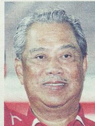
Tan Sri Muhyiddin Yassin