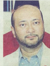
Datuk Seri Mukhriz Mahathir

to launch the Sindumin-Kampung Melalia road project as part of the Pan-Borneo Highway here in Sindumin town.